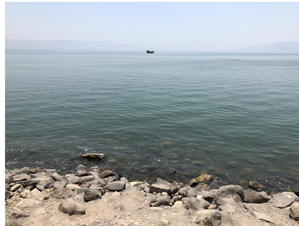
The Sea of Galilee, viewed from the shoreline at Capernaum.

Starkville's Church That Preaches the Doctrines of Grace and That is Part of the EPC – A Global Movement of Evangelical Christians.