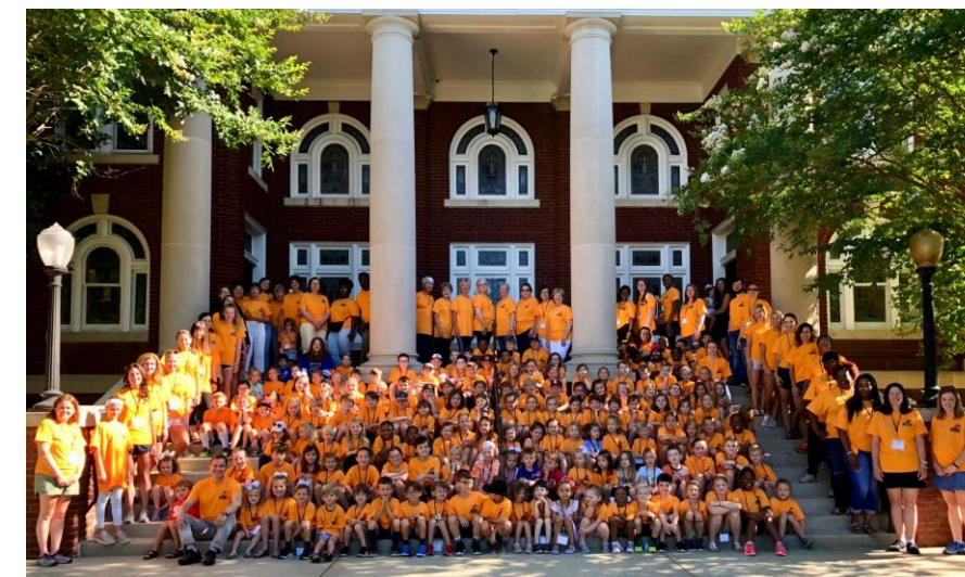
FPC's 2019 VBS Volunteers and Children

For by grace you have been saved through faith – and this is not your own doing. It is a gift of God, not the result of works, so that no one may boast. Ephesians 2:8-9