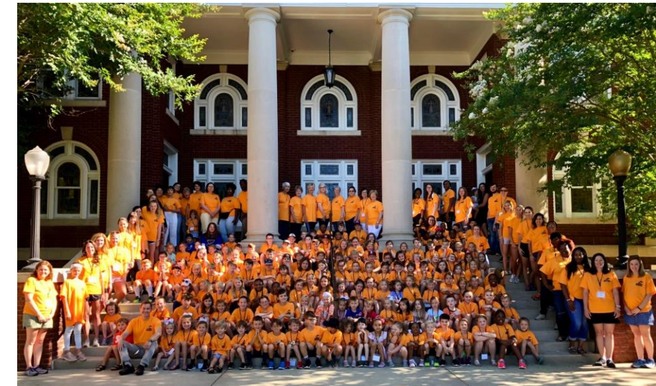
FPC's 2019 VBS Volunteers and Children

For by grace you have been saved through faith – and this is not your own doing. It is a gift of God, not the result of works, so that no one may boast. Ephesians 2:8-9