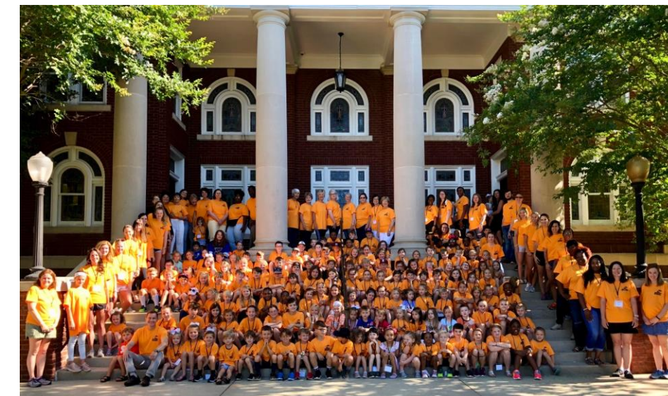
FPC's 2019 VBS Volunteers and Children

For by grace you have been saved through faith – and this is not your own doing. It is a gift of God, not the result of works, so that no one may boast. Ephesians 2:8-9