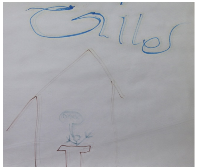
At right – Giles Jones, Zechariah Burning the Incense Offering in the Holy Place of the Temple

There are many stories of good things happening when people were in the right place at the right time and some stories of good things happening when people were in the wrong place at the right time. [continued on Page 3]