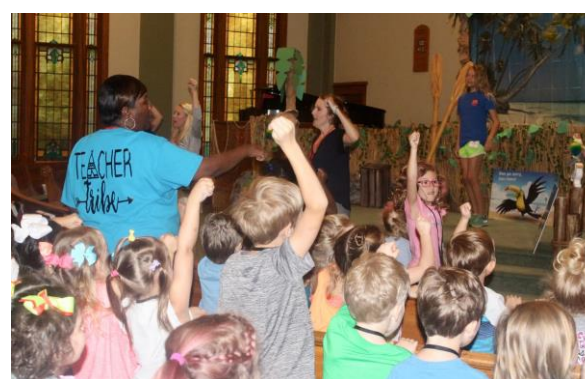
Singing for Jesus